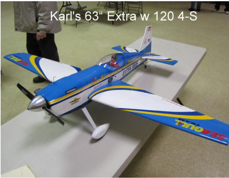
Karl's 63" Extra w 120 4-S