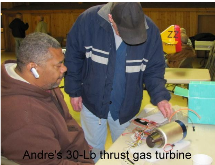
Andre's 30-Lb thrust gas turbine