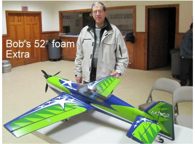
Bob's 52" foam Extra