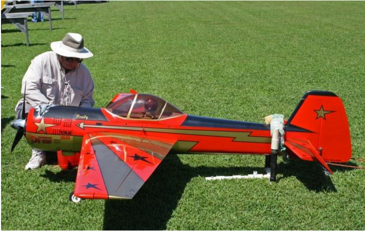
Tom Goraj' 52", electric Extra:

Gregg660 (no spaces) Here's the link to it: http://www.youtube.com/user/gregg660/videos